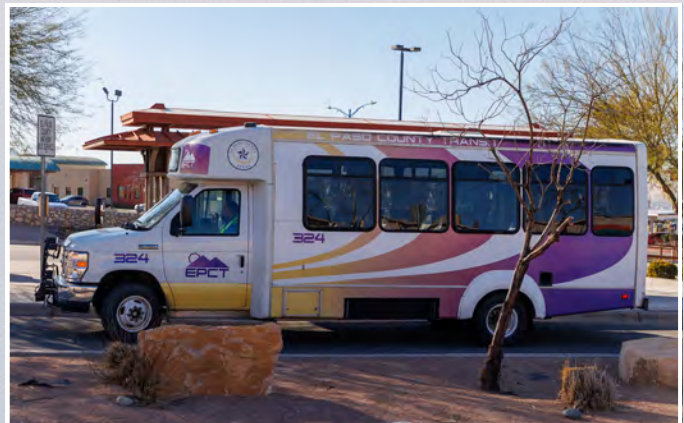
Transit bus number 324 arrives at the Sun Metro Transfer Center on Remcon Dr. before heading back on Doniphan to points north before reaching Anthony and returning to the starting point to repeat the trip.

Information regarding the routes and schedule of the six bus routes is available at https://elpasotransportationauthority.org/ . For more information, call (915) 533-4731.